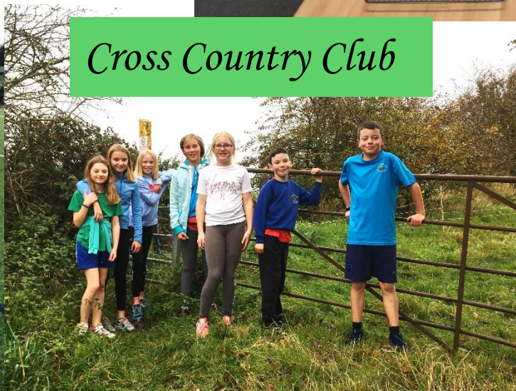
Cross Country Club