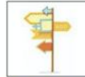
4. PEOPLE OF GOD