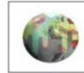
8. KINGDOM OF GOD